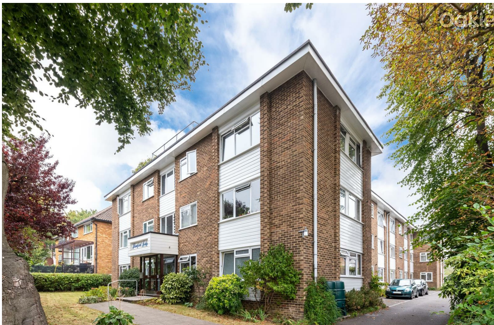
Stamford Lodge, Preston Park, Brighton, BN1 6ZE